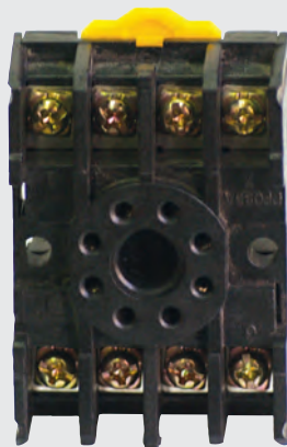
CZF08A 8 PIN ROUND RELAY BASE