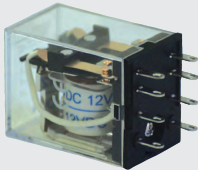
JQX-13F-2Z-012D 11 PIN SQUARE INDUSTRIAL RELAY