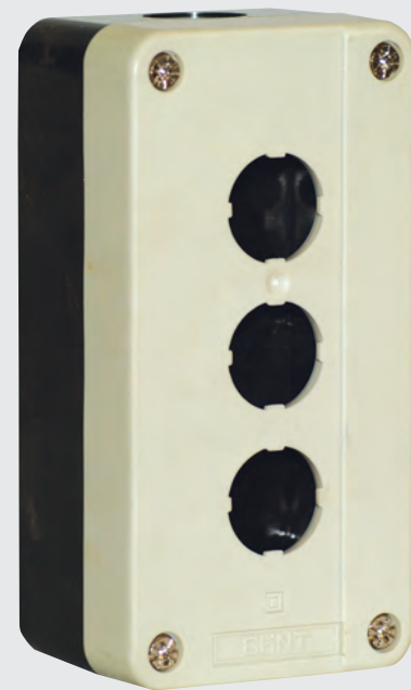
NP2-03 EMPTY ENCLOSURE